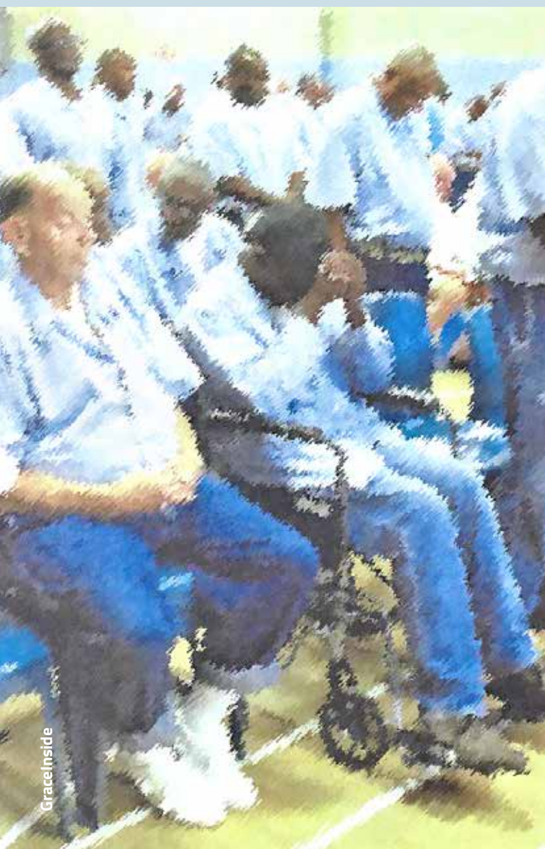
Incarcerated men gather for a time of worship and fellowship at the geriatric ward of Deerfield Correctional Center. The Micah Grant enables the chaplain to spend more time with the sick and dying.

You can help us empower more ministries like GraceInside by donating to the Foundation. For more information, send us an email at foundation@vaumc.org or call 804-521-1121.